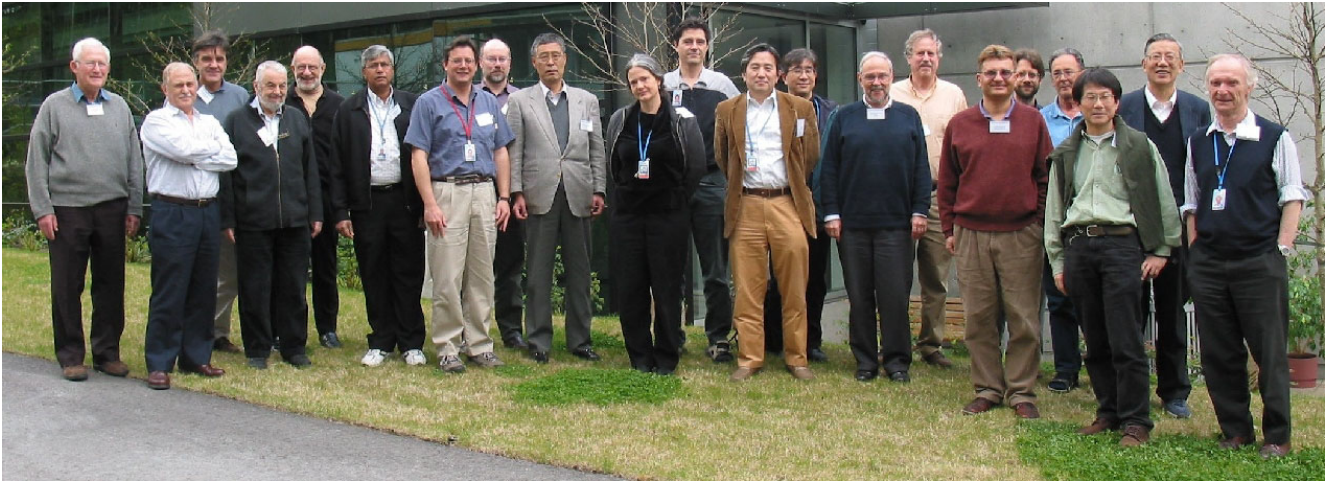
Fig. 255. Attendees at the FFAG2004 Workshop at TRIUMF, including AG pioneer Ernest Courant and FFAG pioneer Andy Sessler (4th and 5th from left).

spread reduced (allowing the use of smaller vacuum chambers and magnets), and the orbit length made to pass through a minimum at mid-energy (instead of rising monotonically), thus reducing the variation in orbit time with energy – a vital consideration since there is no time for rf frequency modulation. Moreover, constant field gradients could be used (rather than constant field index), simplifying the magnet design and rendering non-linear resonances harmless.